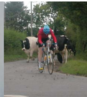
2002 - Going to have to clean my bike now